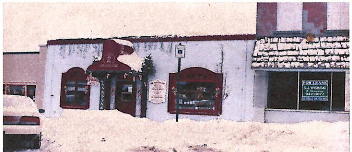
The Melting Pot, located in the heart of downtown Rockford on Courtland St. Parking was always a challenge for loyal customers.

HERMAN'S BOY INC. Roastery • Bakery • Confectionery