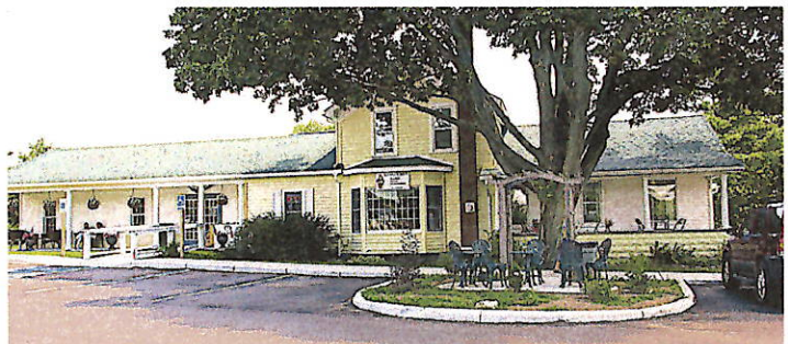
Herman's Boy's location today. A beautiful sprawling building with plenty of goodies to find inside.